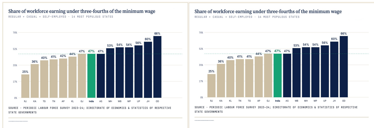
FIGURE 5 · Share of workforce earning under three-fourths of the minimum wage